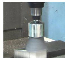
With Brush tool